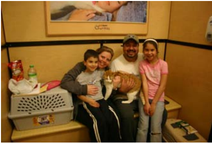
Proud new cat adopters from PetSmart's grand opening