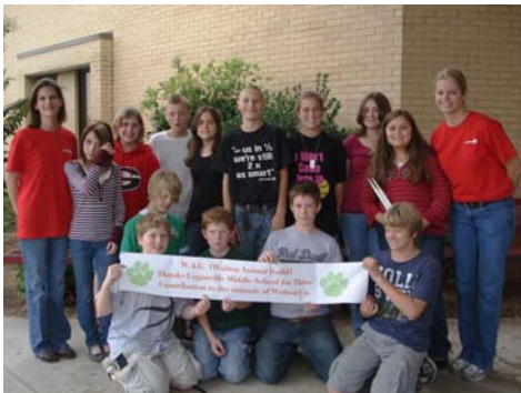
Loganville Middle students

The young pet lovers filled boxes with items like bags and cans of cat and dog food, kitty litter, leashes, collars, toys, and bowls.