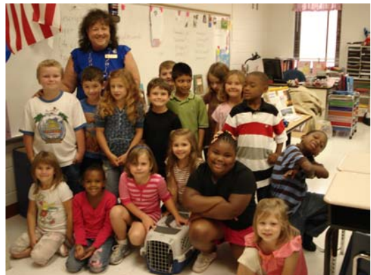
Walker Park Elementary students